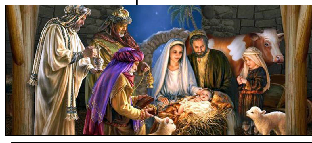
24/25 December, 2024 • Page 2

May joy be your gift at Christmas and may faith, hope and love be your treasures in the New Year.